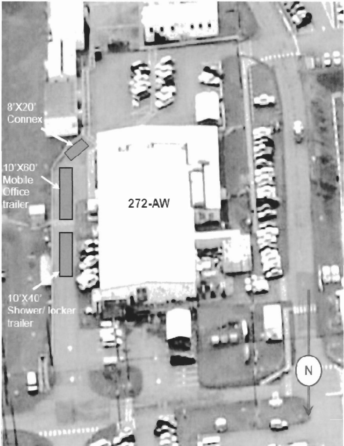
Figure 1. This is an aerial photograph which shows an example of the relative locations of the temporary connex box and the two associated trailers in relation to 272-AW.