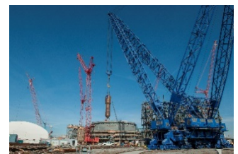
SCE&G Places Final Unit 2 Containment Vessel Ring; The First U.S. AP1000 Steam Generator is placed in Unit 2

At the time of its cancellation, the project was about 65% complete. All four steam generators for Units 2 and 3 were being installed, while two of the four reactor coolant pumps for Unit 2 are on site. Units 2 and 3 were planned to come online in April 2020 and December 2020, respectively.