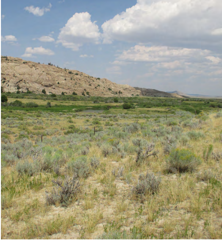
View from north of the Sweetwater River looking south toward the granite peaks at the site.