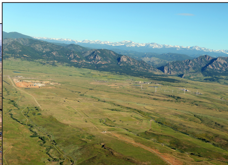
Rocky Flats Site (June 2014).