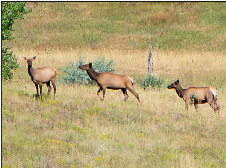
Wildlife at the Rocky Flats Site, Colorado.

At the Rocky Flats Site, LM is responsible for managing land retained by DOE and for compliance with the