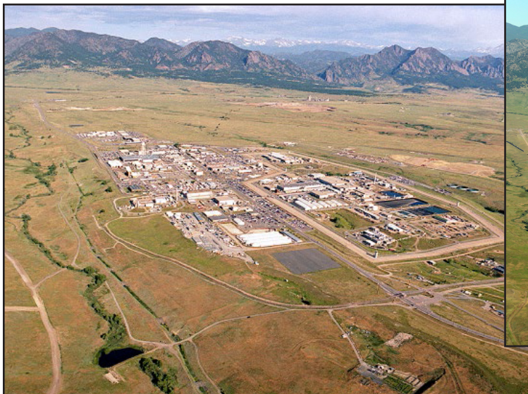
Rocky Flats Site Prior to Final Cleanup (June 1995).