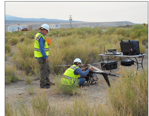
A User Tests a Drone-Mounted Spectral Gamma Detector at Pads Located at the Grand Junction Disposal Site

All facilities are available to users free of charge, but usage should be reported to the DOE office in Grand Junction. Please call to request access or more information. Additional information and technical documents are posted on the DOE Office of Legacy Management website.