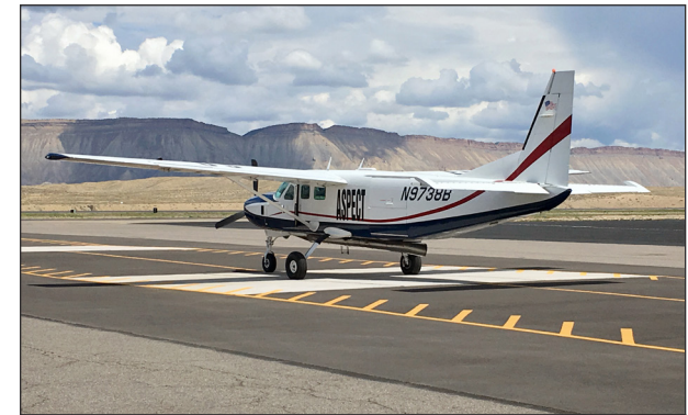
U.S. Environmental Protection Agency Aircraft Calibration

The DOE calibration facilities are recognized internationally for providing well-characterized, stable, and traceable radiation sources. Federal ownership also provides the independence for impartial calibration of gamma detectors, which is required for defensible ore-reserve estimates. The value of publicly traded uranium companies is based on their ore reserves, which are determined from gamma ray well logs used to delineate ore deposits. Calibrations performed at DOE facilities provide the standardization required by financial markets.