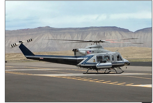
U.S. Department of Energy Aerial Measuring System Helicopter Calibrates Radiation Detectors at the Grand Junction Regional Airport