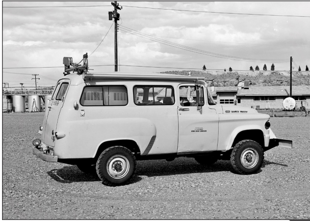
AEC Geophysical Well-Logging Truck, Early 1960s