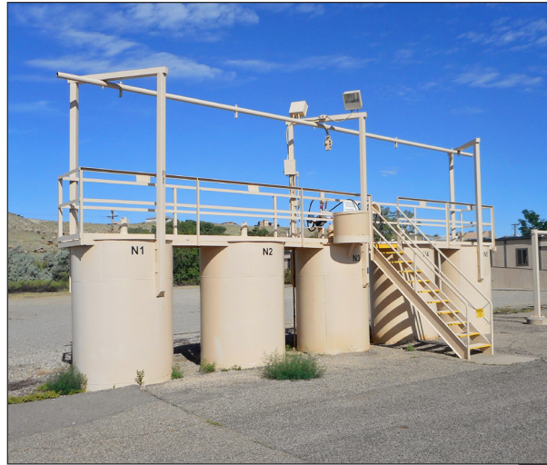
Borehole Calibration Facility in Grand Junction, CO

Uses include uranium exploration and production, remediation of sites contaminated by radioactive materials, and homeland security.