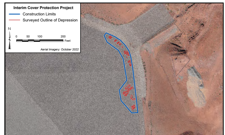
Depression Features on Northeast Side Slope and Approximate Area of Interim Cover Protection Project.

For more information see the site's Disposal Cell Evaluation Information Sheet .