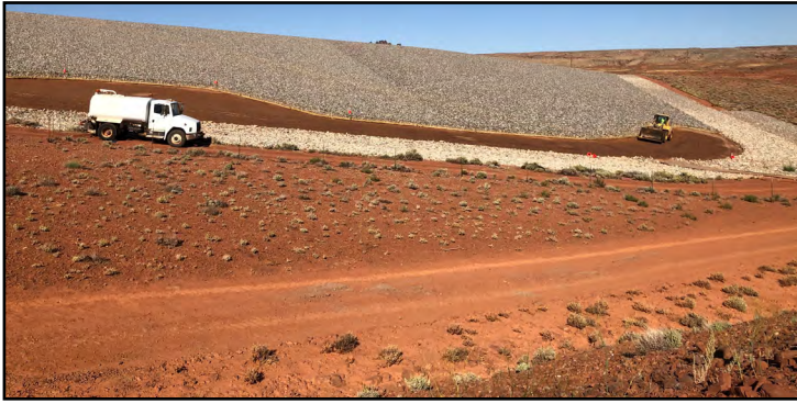
Mexican Hat Interim Cover Protection Project.