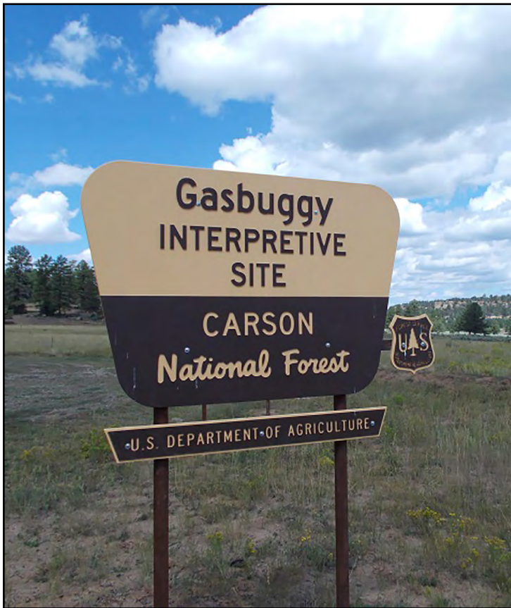
Gasbuggy, New Mexico, interpretive site.