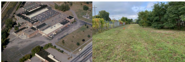
Colonie National Lead Industries plant, 1983.

FUSRAP personnel reviewed the radiological conditions at more than 600 sites that were potentially involved in early atomic weapons and energy activities, and they identified 46 sites that met the requirements to be included in FUSRAP. A descendent of the AEC, DOE began cleanup projects in 1979 and completed 25 sites. In 1997 Congress assigned responsibility for cleanup of remaining sites – and any subsequently added sites – to USACE. After USACE cleans up a site, DOE takes over the site's long-term stewardship and maintenance.