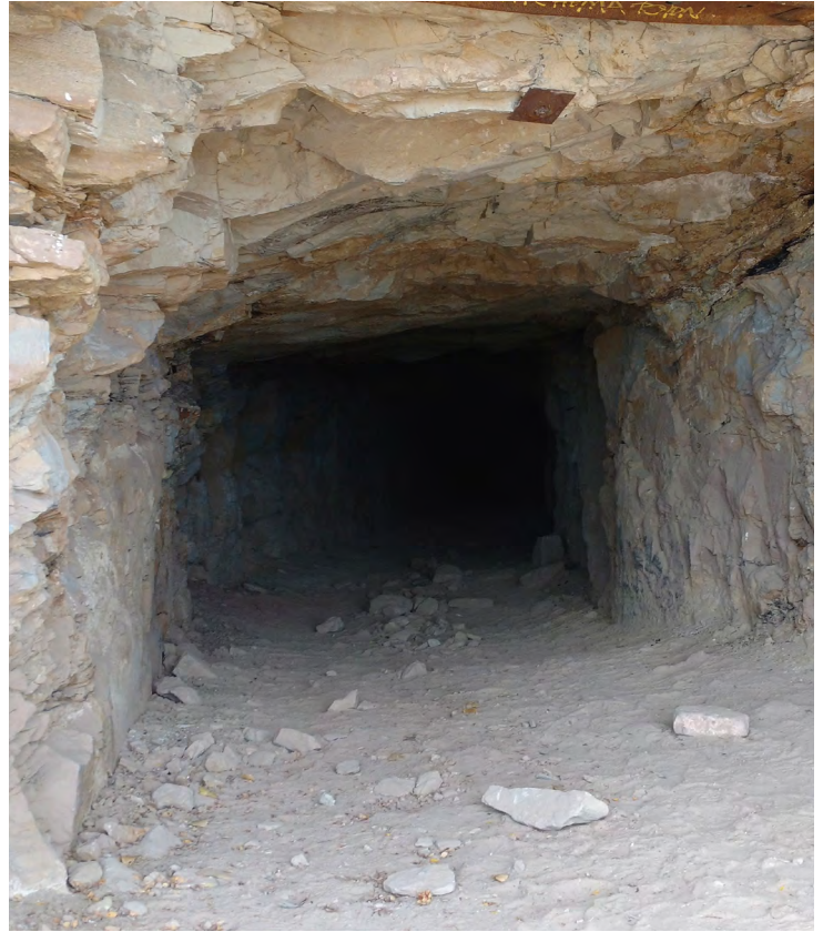
Adit at the Cedar Mine, a Small Mine Located Southeast of Moab, Utah (BLM-administered land).

Field crews implementing the work administered by LM are the backbone of the program. Their efforts support LM in achieving its current goal of evaluating over 2,300 DRUM sites located on public land by the end of CY 2024. LM aims to evaluate all mines on Tribal lands by Sept 30, 2027, and all mines on private land by Sept 30, 2028.