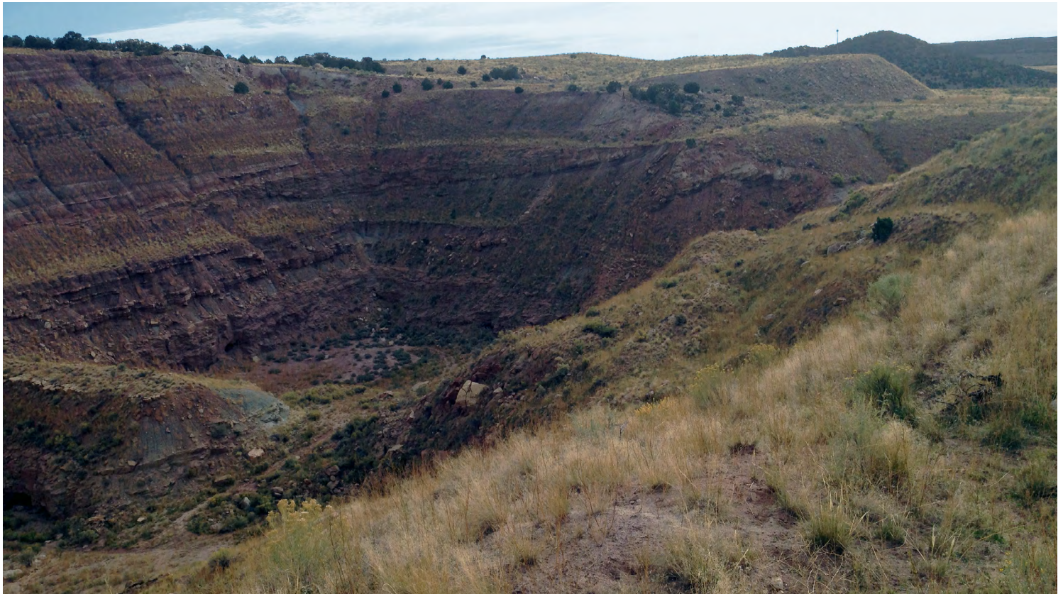
Rattlesnake Open Pit, a Large Mine Located Southeast of Moab, Utah (BLM-administered land).