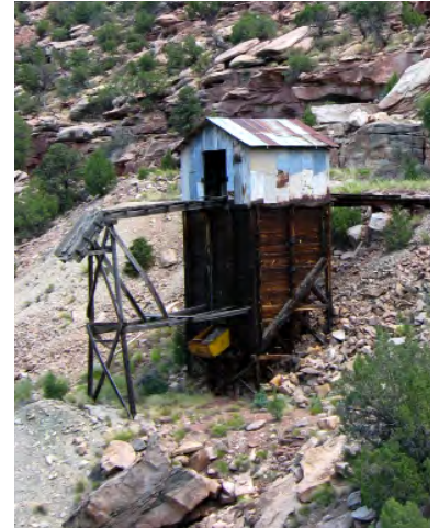
Wild Steer Mine (BLM-administered land).

report, which identified significant data gaps for DRUM sites. LM determined that further review of DRUM sites was needed to fully meet the intent of the act. For more information, please visit the Report to Congress web page at www.energy.gov/lm/defense-related-uranium-mines-report-congress .