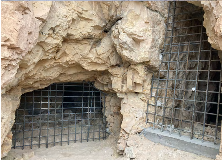
Adits at the Mucho Claims Mine, located southwest of Green River, Utah, before and after safeguarding (BLM-administered land).