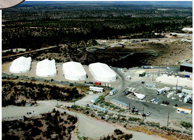
Waste Storage Domes at Area G

CONTACT DOE Environmental Management Los Alamos Field Office (505) 665-5658 | publicaffairs.emla@em.doe.gov