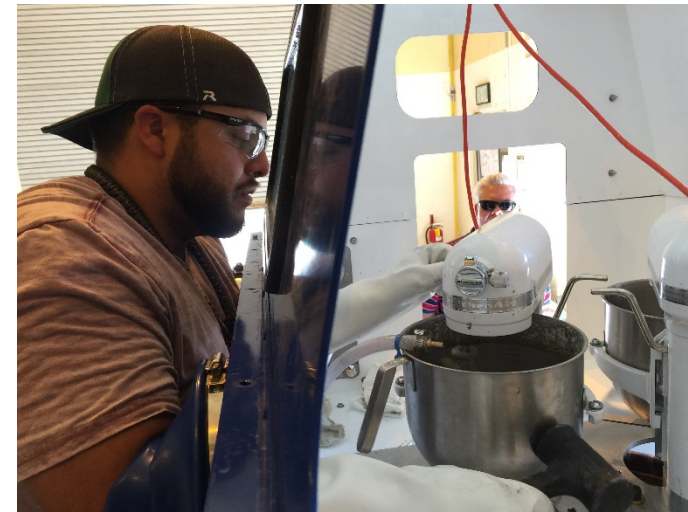
Technicians spent several months practicing the treatment procedure