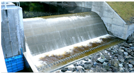
Young's Creek Hydro Project in Washington State, 2011 (7.5 megawatts)