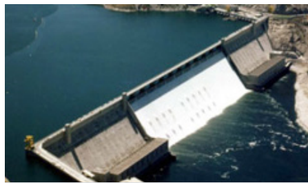
The Grand Coulee Dam provides nearly $2 billion in annual economic activity.