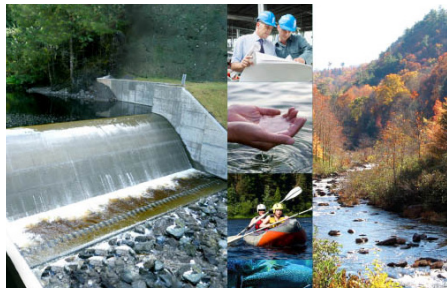
Significant potential exists for new low-impact hydropower development.

Market Acceleration and Deployment: HydroNEXT will continue activities to help lower barriers to deployment of innovative water power technologies,