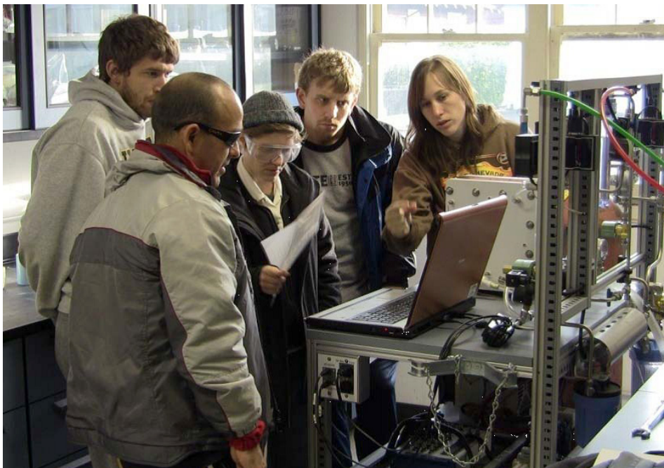
Humboldt State students in a renewable energy class perform fuel cell experiments using an H 2 E 3 test station, December 2010

The Schatz Energy Research Center (SERC), part of the Humboldt State University's Hydrogen Energy in Engineering Education (H 2 E 3 ) project, included the development of hydrogen and fuel cell curriculum material and teaching tools for a hands-on experience in classrooms and labs for undergraduate engineering students in California's public universities. SERC developed hydrogen and fuel cell curricula and distributed more than 50 experimental bench top fuel cell/electrolyzer test stations for student laboratories. SERC