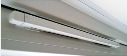
Trickle vent ≈ 4 in. 2