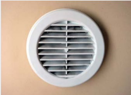
Airlet ≈ 2.6 in. 2

For more information see the Building America Measure Guideline Passive Vents at buildingamerica.gov .