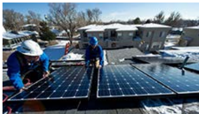
The updated DSIRE tool helps homeowners find incentive programs that can reduce or defray installation or purchase costs of technologies such as photovoltaic systems.

Visit the DSIRE website to find policies and incentives near you.