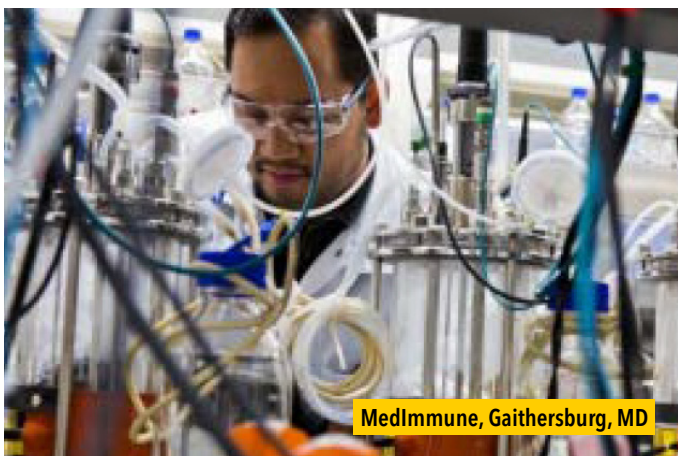
MedImmune, Gaithersburg, MD

MedImmune [Gaithersburg, MD] achieved recertification to ISO 50001 and SEP in August 2017, improving its energy performance by another 8.9% over 3 years, on top of similar savings achieved during its initial certification in 2014. Read more >>